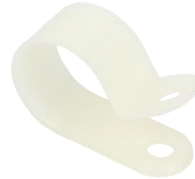
Nylon Cable Clamps