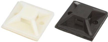
Cable Tie Mounts