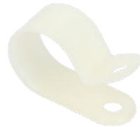
Nylon Cable Clamps