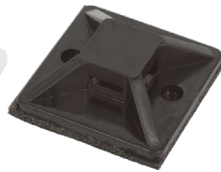
Cable Tie Mounts